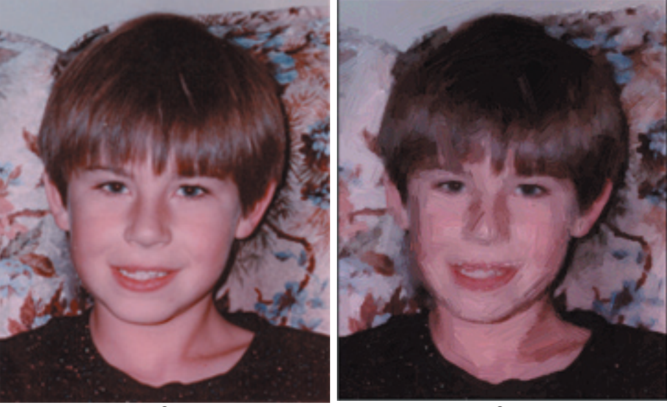
Before After You can set the paint strokes to be subtle or quite pronounced. I had it set to the higher settings for this example so you can see the difference.

Here are the settings parameters for the Painting and the Text tabs.