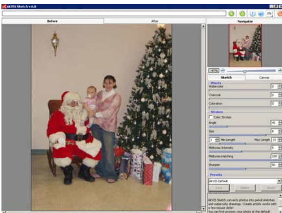
Sketch interface (plug-in) with sample original image

As you can see from the above screen capture, there are very few controls involved in Sketch. What there are are